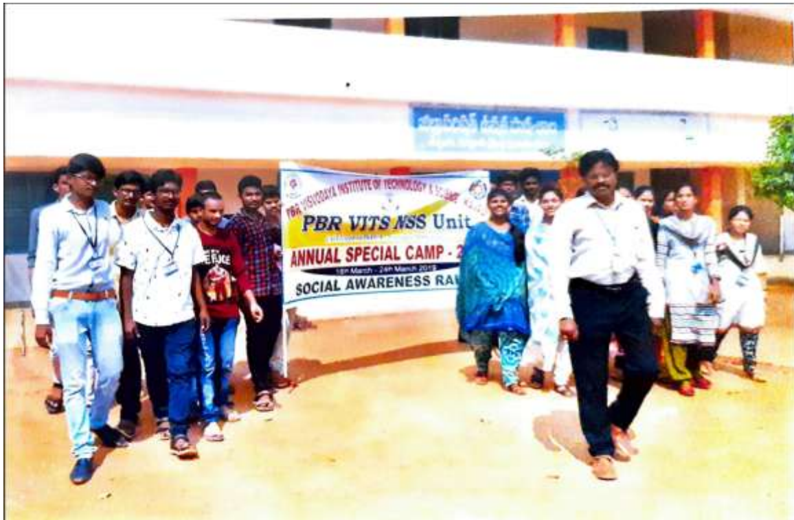
ANNUAL SPECIAL CAMP CHEVURU VILLAGE