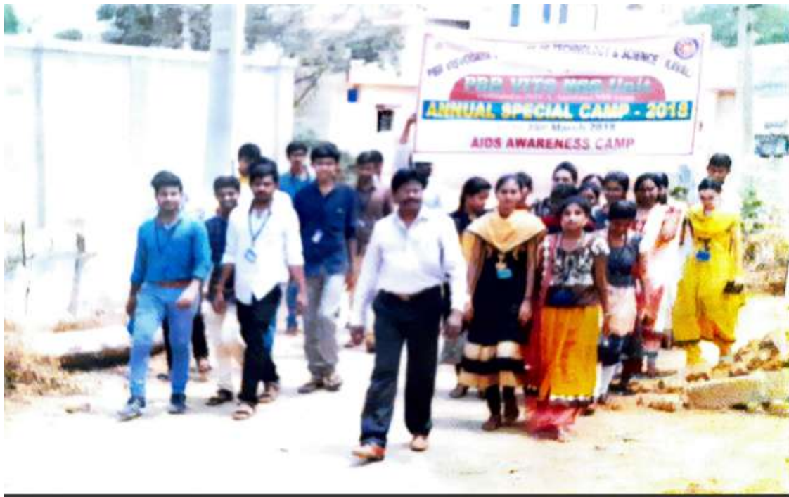
ANNUAL SPECIAL CAMP – JALADANKI VILLAGE