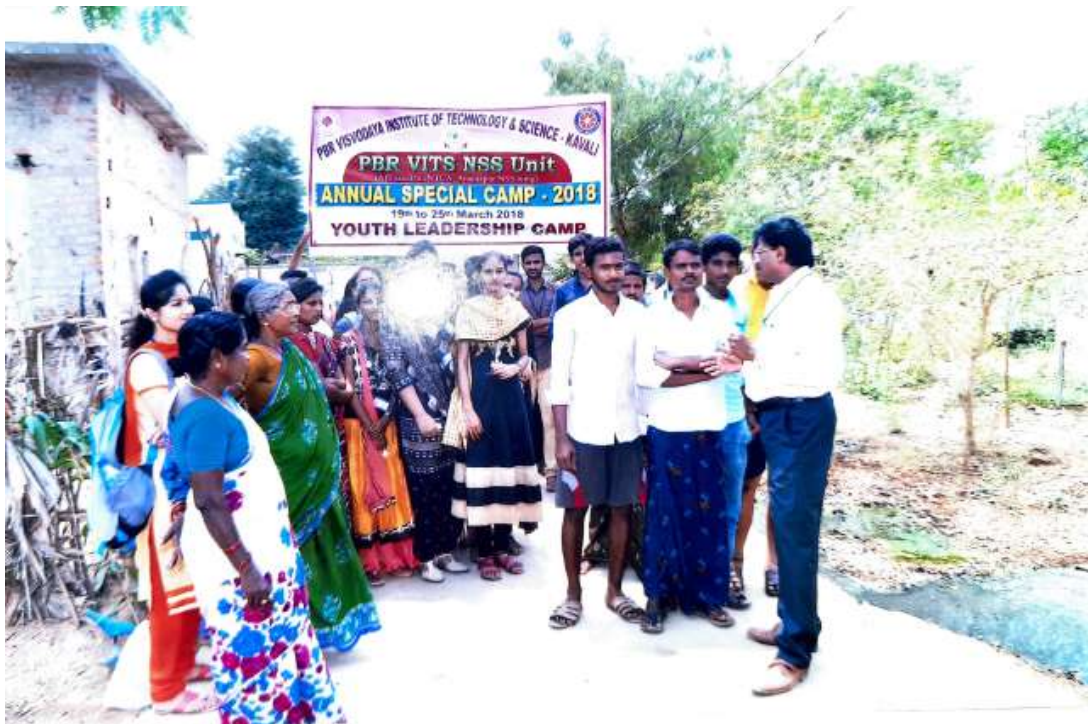
ANNUAL SPECIAL CAMP – JALADANKI VILLAGE