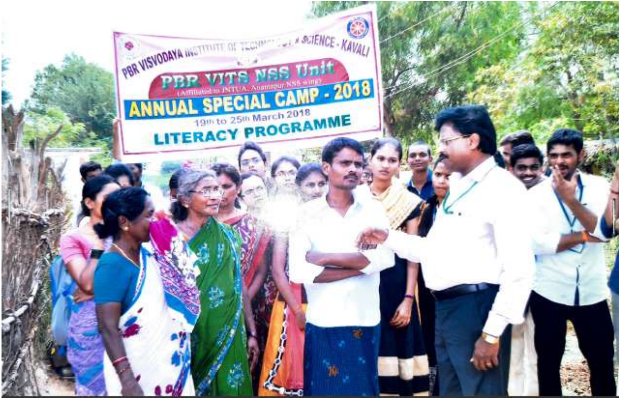
ANNUAL SPECIAL CAMP – JALADANKI VILLAGE