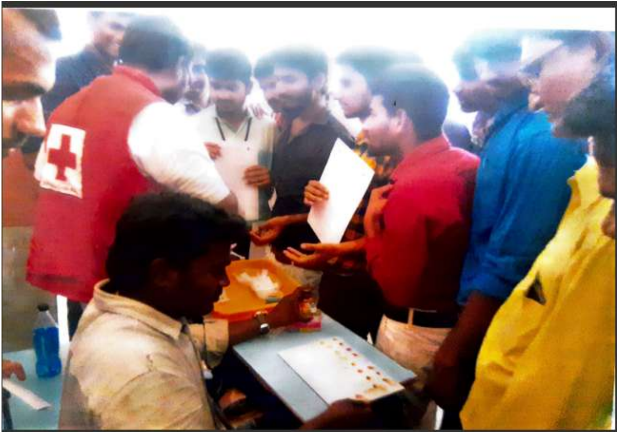
Blood Grouping – 20/03/18