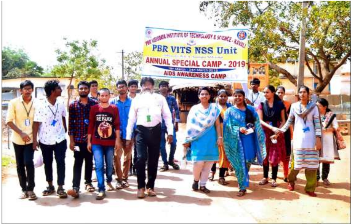
ANNUAL SPECIAL CAMP CHEVURU VILLAGE