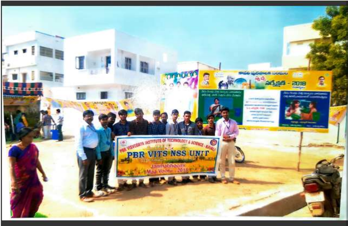
Janma Bhoomi-Maa Vuru 11/01/18