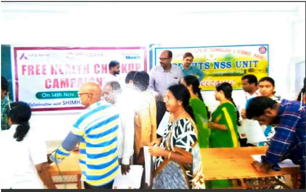
Medical Camp by Simhapuri Super specialty hospital, Nellore – 14/11/17