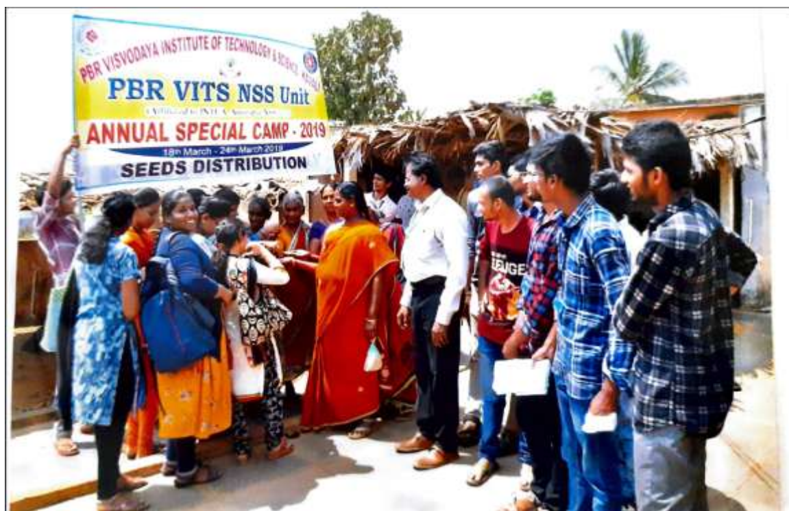
ANNUAL SPECIAL CAMP CHEVURU VILLAGE