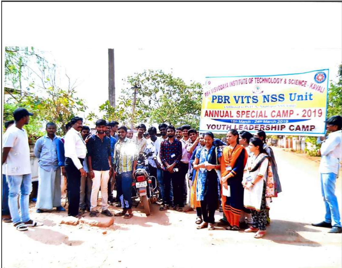
ANNUAL SPECIAL CAMP CHEVURU VILLAGE