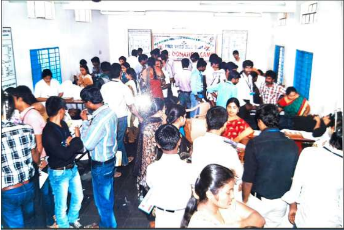
BLOOD DONATION CAMP 19/02/19