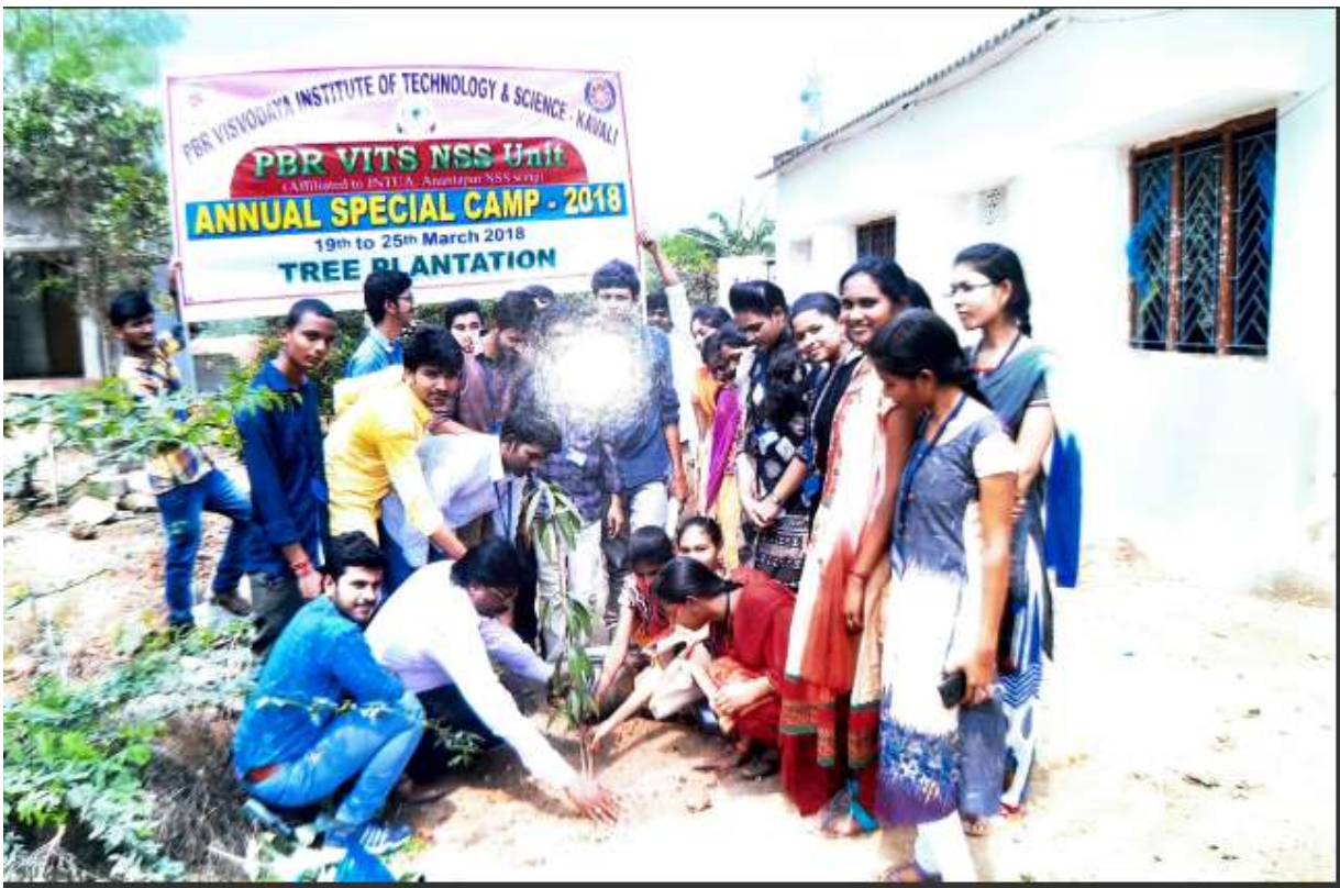
ANNUAL SPECIAL CAMP – JALADANKI VILLAGE