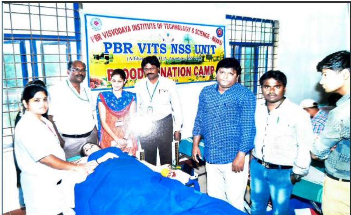
BLOOD DONATION CAMP ON 20/03/18