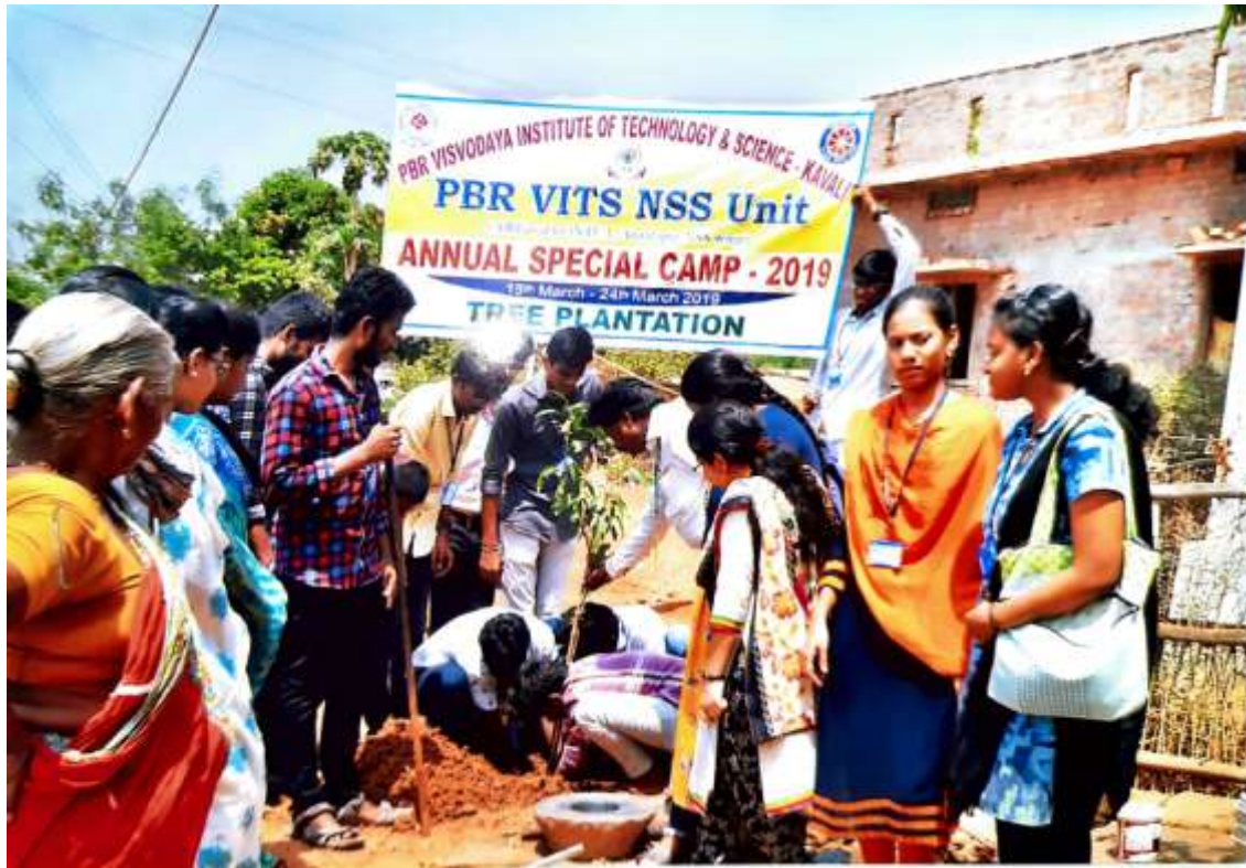
ANNUAL SPECIAL CAMP CHEVURU VILLAGE