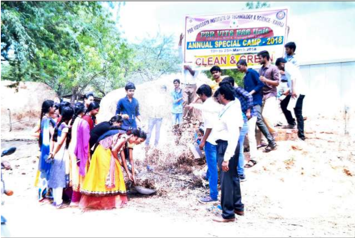
ANNUAL SPECIAL CAMP – JALADANKI VILLAGE