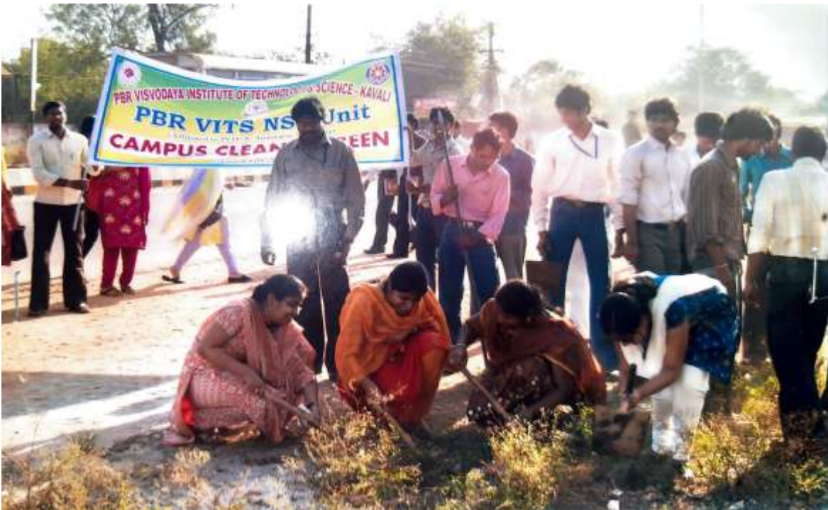
Clean & Green Program – 15/03/19