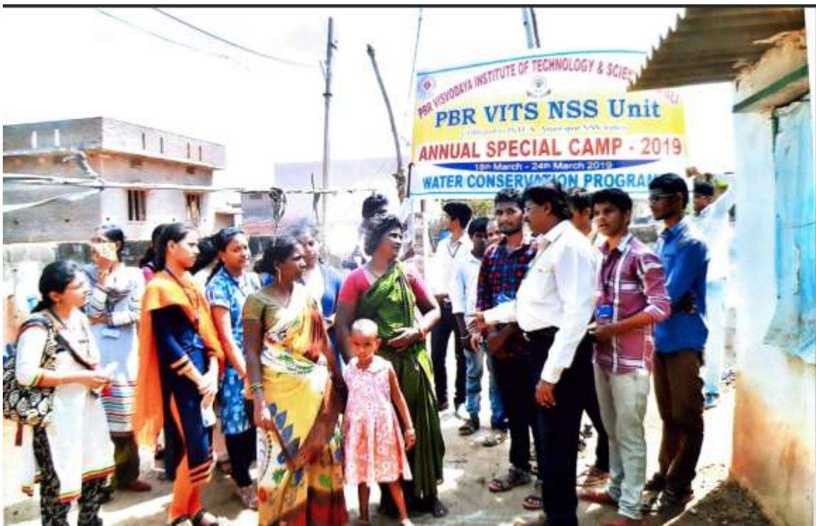
ANNUAL SPECIAL CAMP CHEVURU VILLAGE