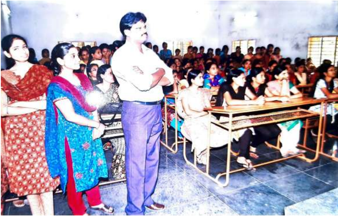
World Water Day – 22/03/19