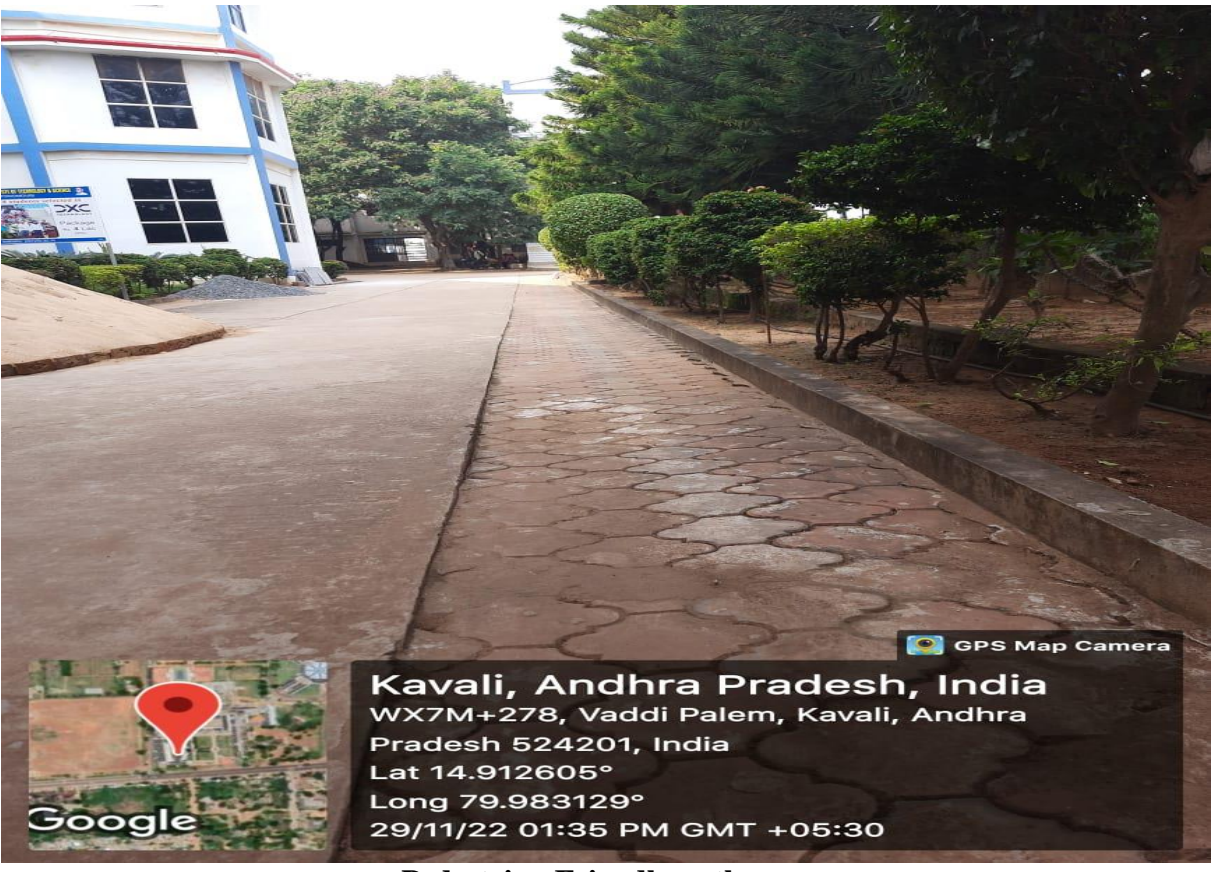
Pedestrian Friendly pathways