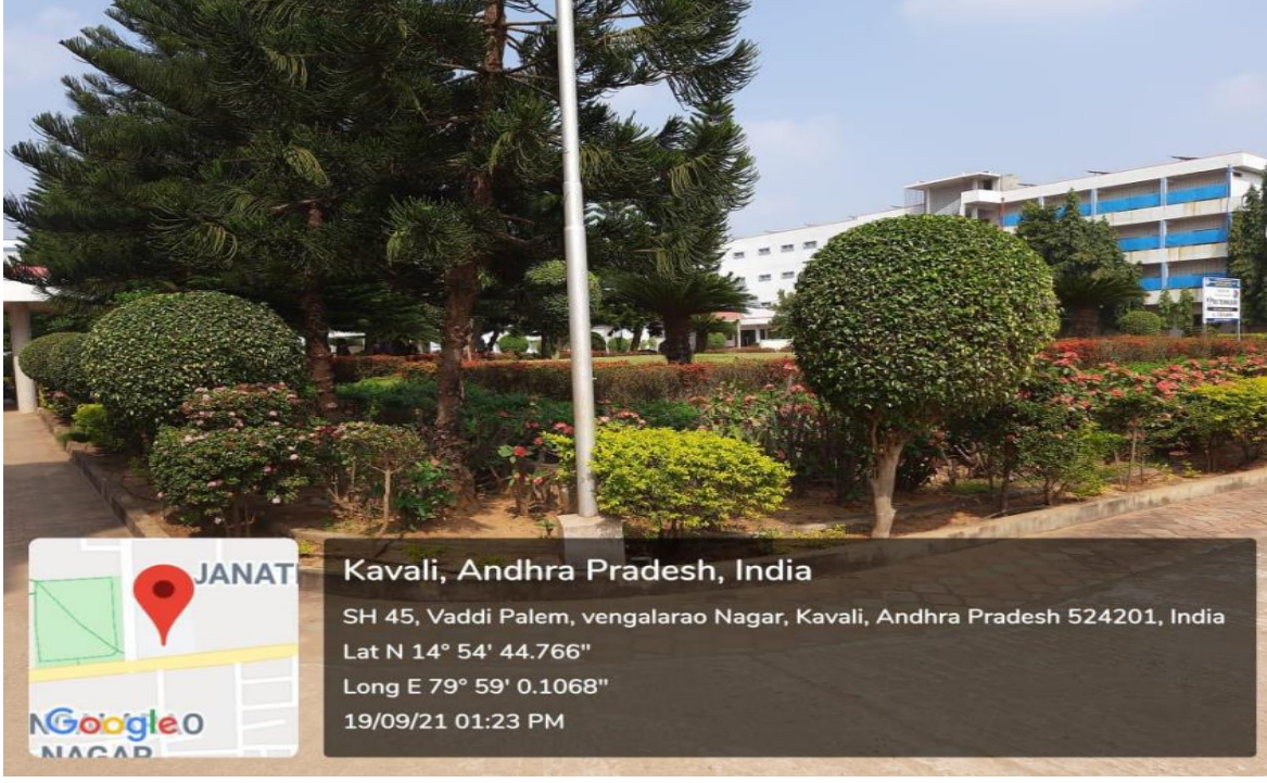
Land scaping with trees and plants