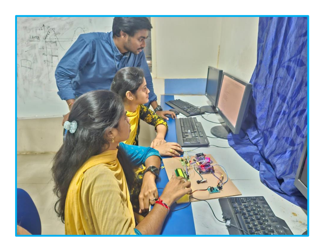
Figure: Project Lab