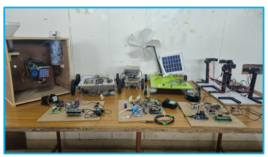
Figure: Project Lab